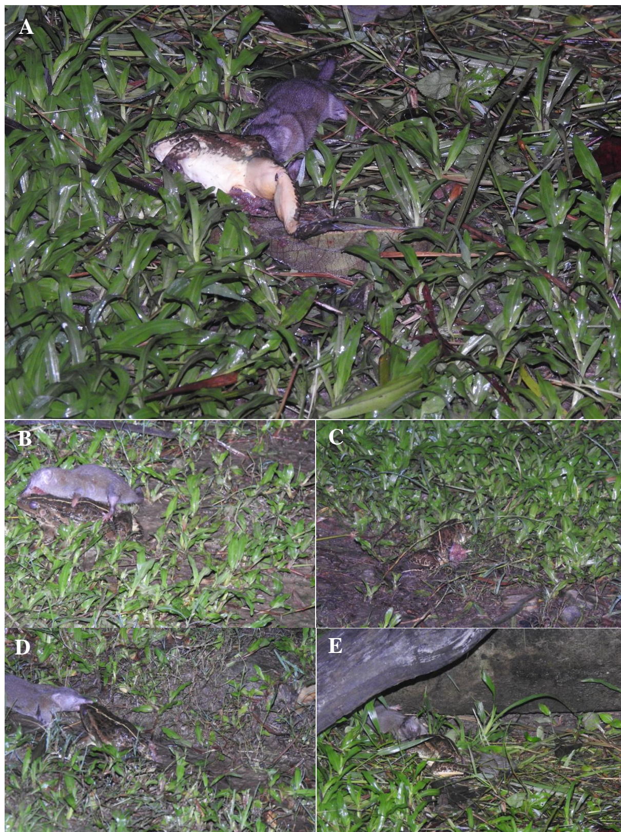
Figure 2: Observations on Suncus murinus feeding on Hoplobatrachus tigerinus : the shrew chewing on the frog (A), the shrew grabbing the frog and further chewing (B), when disturbed by the light the shrew left the prey (C), the shrew started dragging the frog towards a hideout under some wood (D and E).