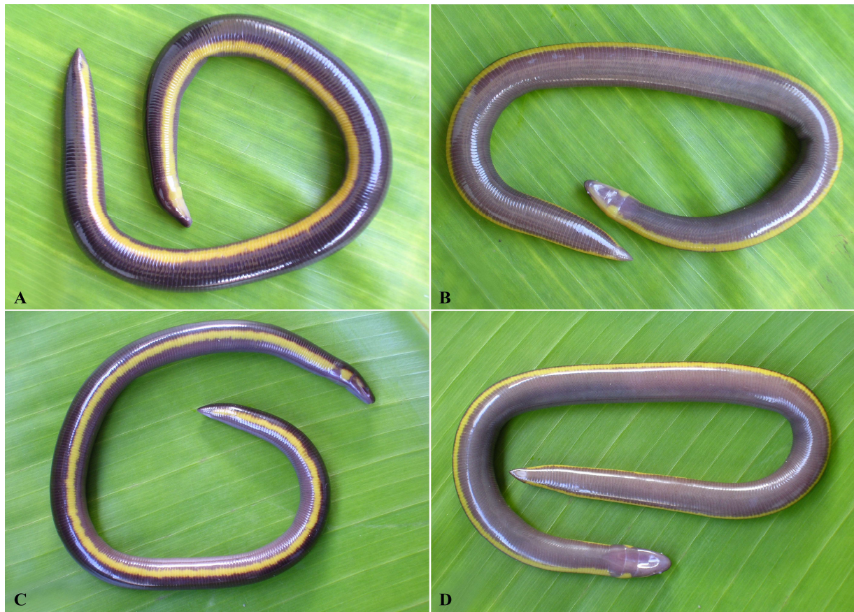
Figure 4: Congeneric species of Ichthyophis co-inhabiting along with Ichthyophis longicephalus in peninsular India: Ichthyophis beddomei , dorsal (A) and ventral (B) views; dorsum (C) and ventrum (D) of Ichthyophis kodaguensis .

1870)) (Malathesh et al., 2002; Venu and Venkatachalaiah, 2006) and one Uraeotyphlus (Venu pers. observ.).