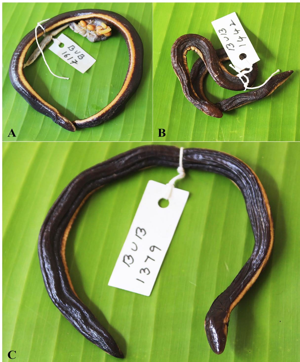
Figure 2: Adult specimens of Ichthyophis longicephalus collected from Regional Agricultural Research Station, Ambalavayal, BUB1617 (A), Kuchikunnel tea plantations, Gudalur, BUB1442 (B) and Himakshama estate, Jodupala-Made village, BUB1379 (C).

Two specimens of I. beddomei were collected from the estate and the site of collection was about 100 m away from the site of I. longicephalus .