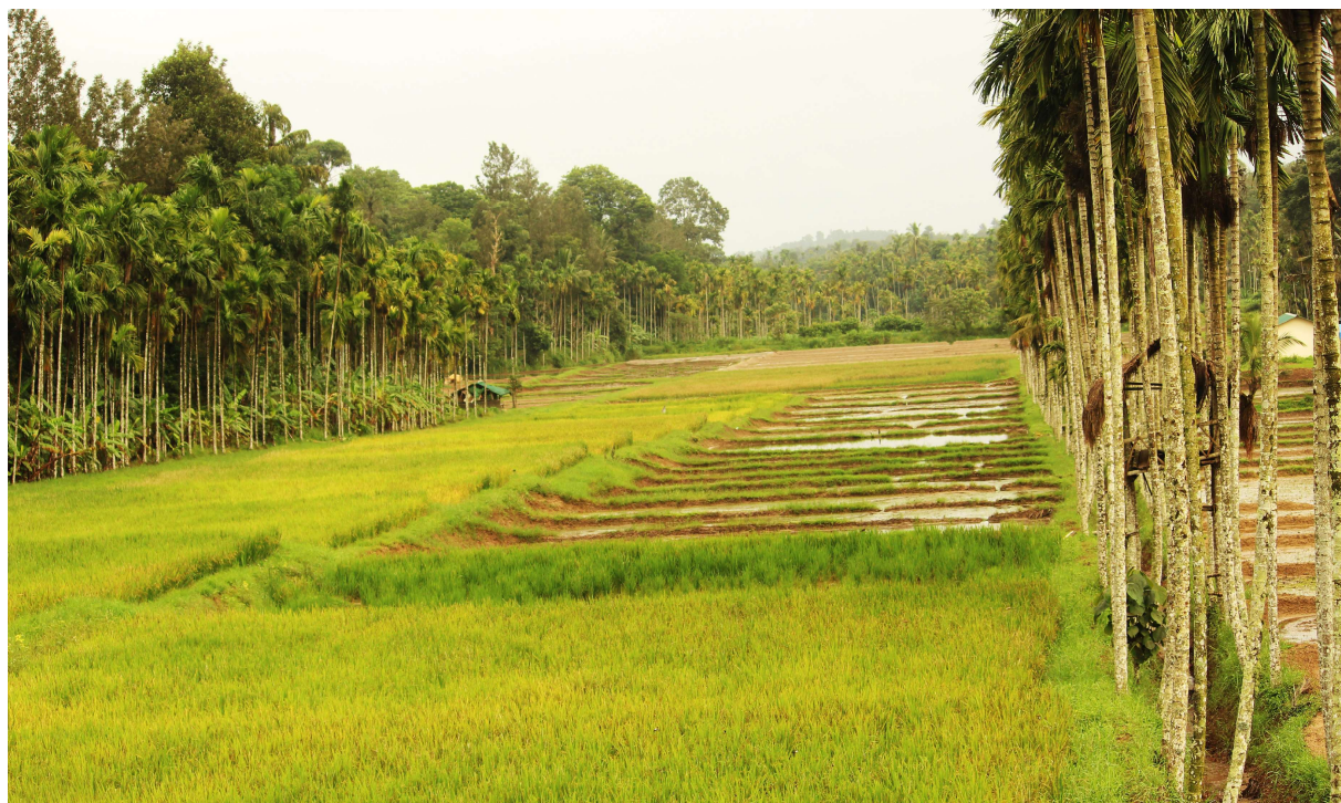
Figure 3: Paddy fields in the midst of coffee, arecanut, coconut plantations (Regional Agricultural Research Station, Ambalavayal), a habitat of collection of I. longicephalus .