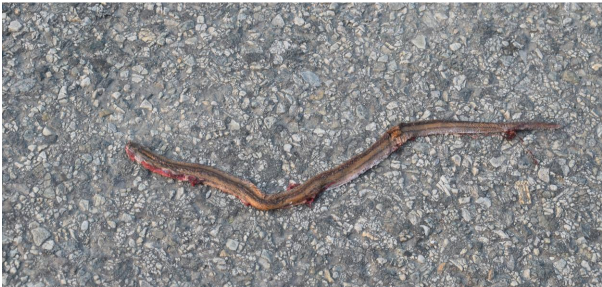
Figure 2: Road-killed specimen of Oligodon cyclurus recorded from Pathari-Kanepokhari road segment, Morang, Nepal.

mm; MSR 19; VS 168; SC 36 (divided); SL 8 (4 th and 5 th in contact with the eye); EyeL 3 mm; IOD 7 mm; IND 6 mm; PrO 2; and PtO 2. The cream-colored vertebral streak ran from the base of the head to the tail tip. The ventral scales exhibited black dots which were more prominent towards the posterior end. However, such dots were absent in the subcaudal scales (Figs. 2 and 3).