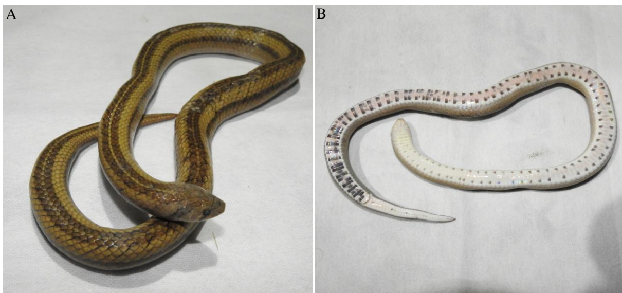
Figure 3: Dorsal (A) and ventral view (B) of Oligodon cyclurus recorded from Ranjani village, Morang, Nepal.