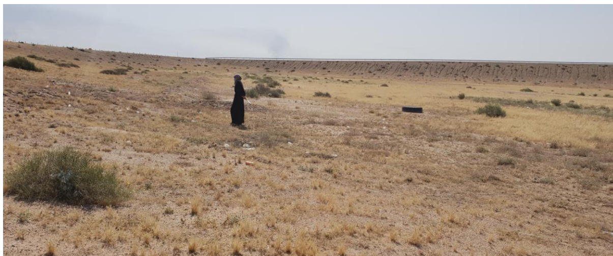
Figure 2: The habitat of Latrodectus dahli Levi, 1959 in Al-Rumaila, Al-Shamalia, Basra, Iraq.