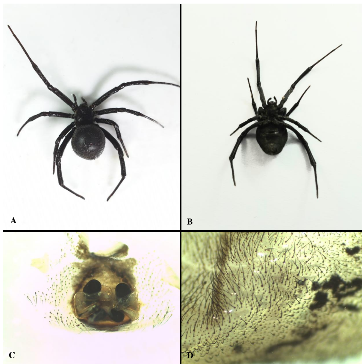
Figure 4: Latrodectus dahli Levi, 1959, from southern Iraq. Habitus of female, dorsal view (A), ventral view (B), vulva, dorsal view (C), and long and short setae on abdomen (D).