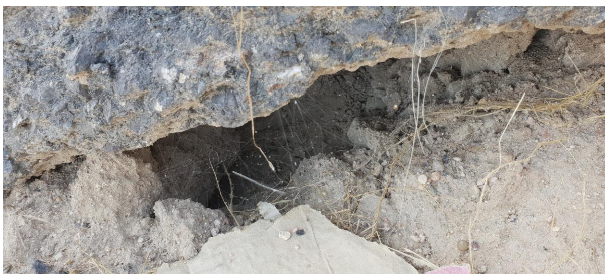
Figure 3: The habitat of Latrodectus dahli Levi, 1959 with its scaffold web, from Al-Rumaila, Al-Shamalia, Basrah, Iraq.

Latrodectus dahli is similar to L. hystrix Simon, 1890 in the female internal duct system but differs in the shape and coloration of the opisthosoma (Knoflach and van Harten, 2002: pl. 49–52).