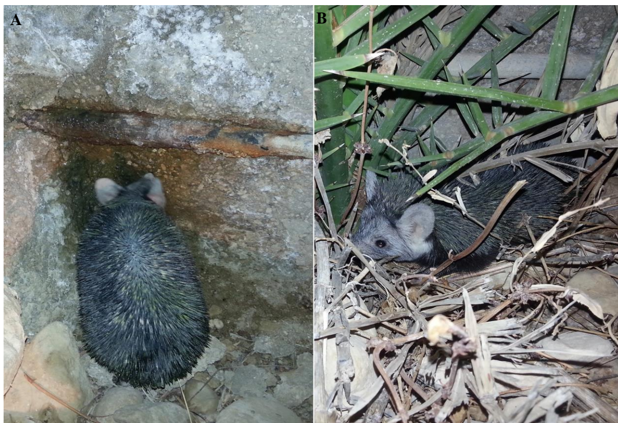
Figure 4: Paraechinus hypomelas from Varavi District, southwest of Fars Province. Entering residential areas for drinking water during summer (A), hiding behavior in the bush (B). Photos by Ali Gholamifard, 13 August 2015.