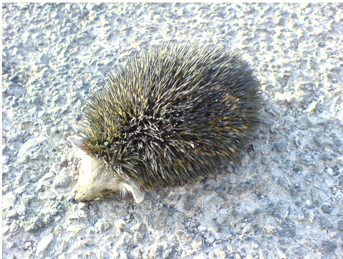
Figure 3: A Hemiechinus auritus on the road surface killed by motor vehicle, in Lamerd region, southwestern Fars Province.

Subsequently, the first author as a zoologist has had a more scientific focus on the mammals of Fars Province, noting where hedgehog specimens were found at the night in desert areas or were killed on the roads by motor vehicles (Fig. 3). Most of the observed specimens were blackish (Fig. 4) but in rare cases they were yellowish. One H. auritus individual (Fig. 3) was found dead on 25 March 2008 in the “Chah Shour Pass” (27°25'56.38"N; 53°18'30.41"E), a mountain pass in the southern Zagros Mountains, about 15 km from the city Lamerd, capital of Lamerd County in southwest of Fars Province (Fig. 2). Its habitat, part of Varavi Mountain, grows on calcareous soils with scattered bushes and trees. The second H. auritus (Fig. 5) was found during the night on 22 July 2018 in Varavi City (27°27'51"N; 53°3'44"E), Mohr County in southwest of Fars Province. The northeast end of the city is near the foothills of Varavi Mountain and close to palm gardens (Fig. 6).