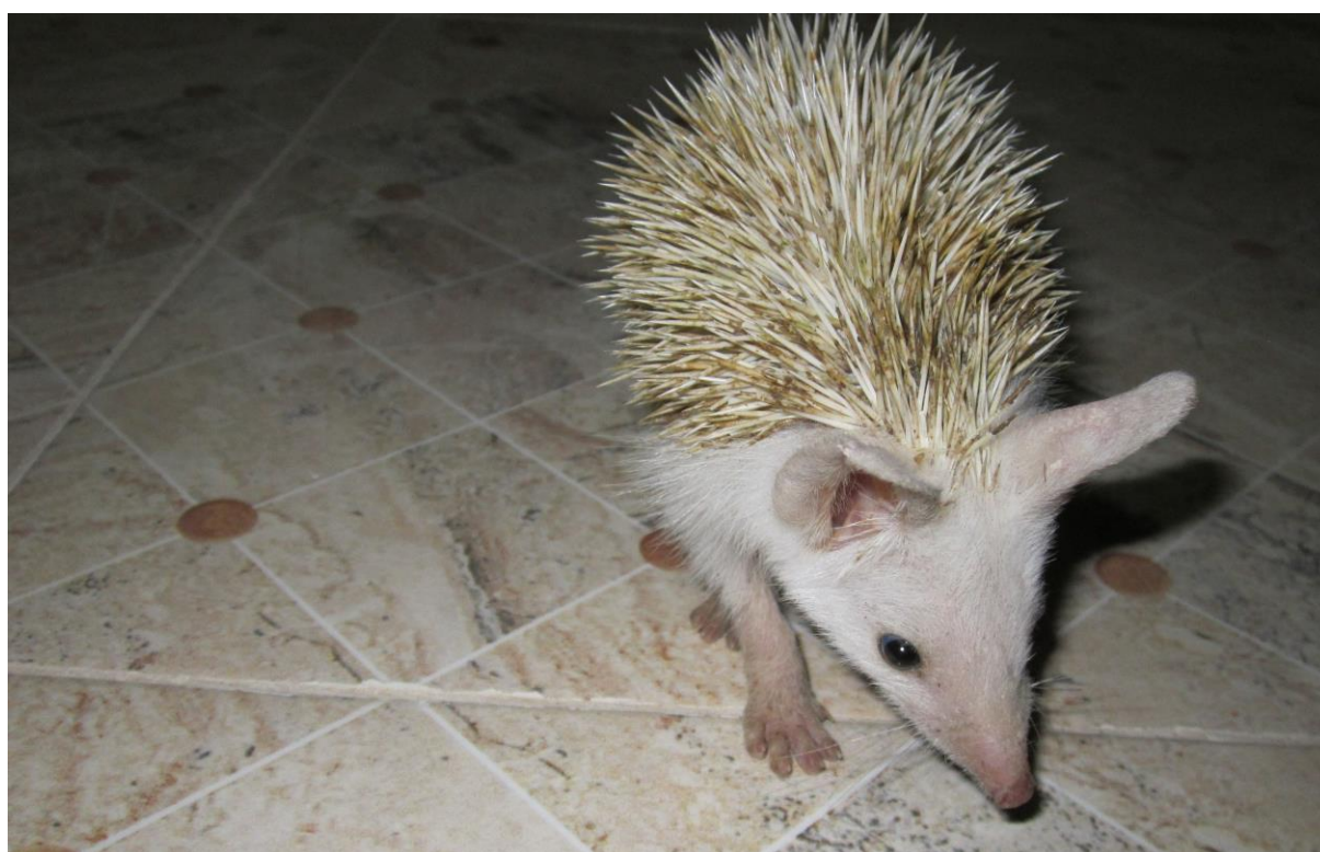
Figure 5: Hemiechinus auritus , in very brief captivity, from Varavi District, southwest of Fars Province.