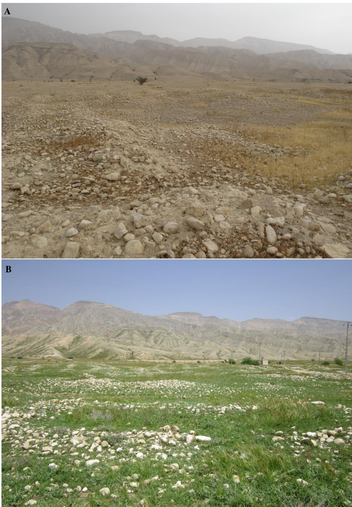
Figure 6: New locality record of Hemiechinus auritus , in hillside of the Varavi Mountain, northeast of Varavi city, southwest of Fars Province in March 2016 (A) and the same habitat in April 2019 (B), respectively.