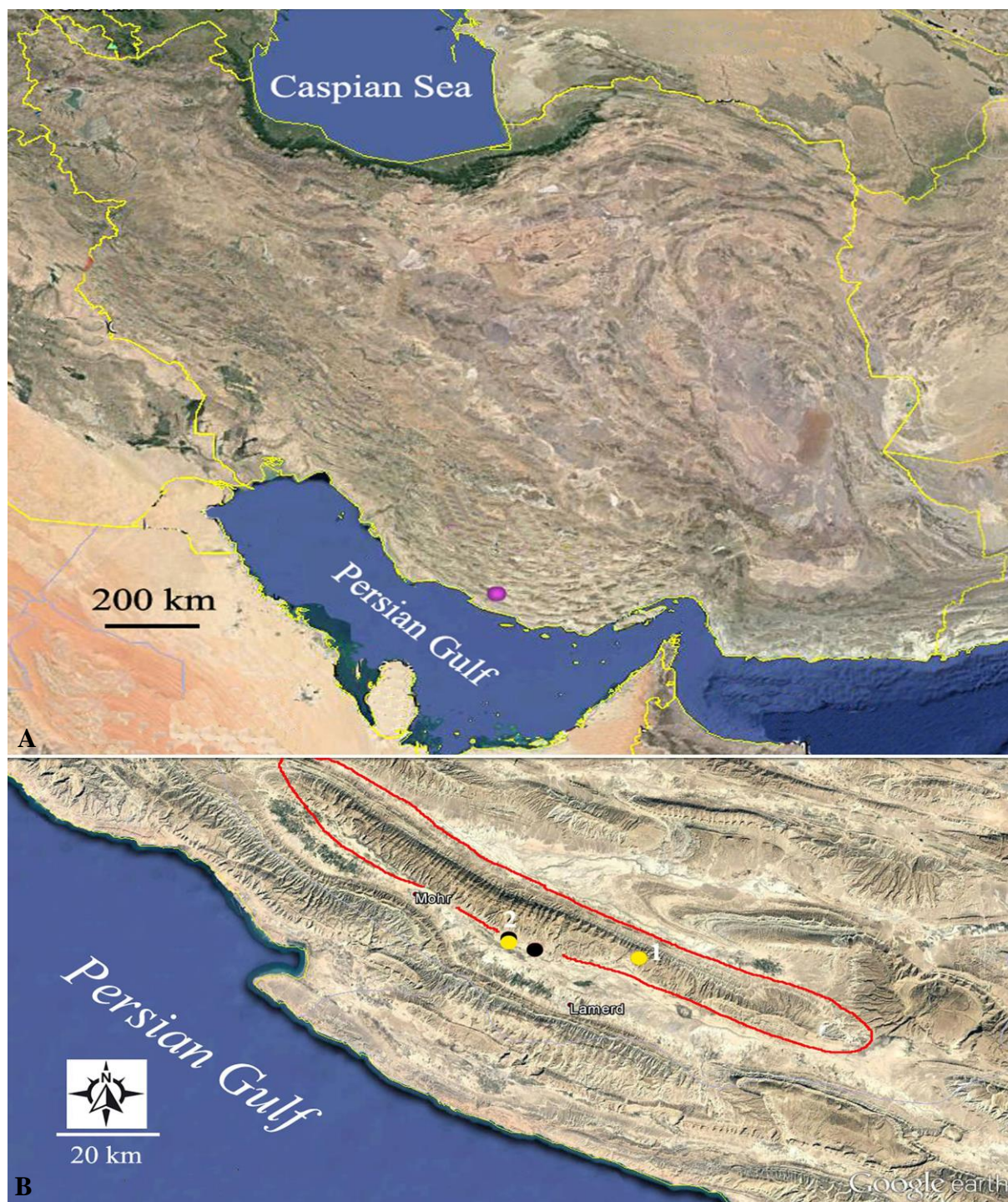
Figure 2: Map of Iran (A) showing the location of Hemiechinus auritus (pink circle) at Varavi District in Fars Province; selected section of Iran map along the Persian Gulf (B) showing Varavi Mountain with red line, and new localities of H. auritus (yellow circles 1 and 2) and Paraechinus hypomelas (black circles), respectively. Map from Google Earth ( www.earth.google.com ).

The results of this study are based on several scattered field observations in southern and western Iran. Figure 2 shows the localities of new records in Mohr and Lamerd Counties in the southwest of Fars Province, southern Iran.