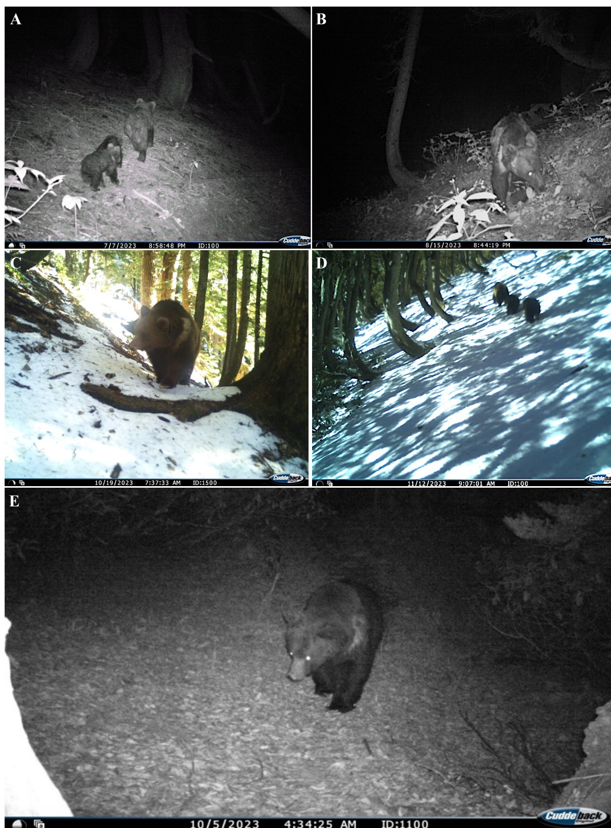
Figure 2: Camera trap images of Himalayan brown bear captured in different grids in Bani Wildlife Sanctuary, (A) an adult female with two cubs near Heiu Nallah (grid-27, 2567 m asl), (B) another adult between Thalli Nallah Forest and Somphu Forest (grid- 27, elevation 2754 m asl), (C) an adult in Dhanbiyal (grid-22, elevation 2765 m asl), (D) an adult female with two cubs in Chattri (grid-7, elevation 3465 m asl), Sudhmahadev Conservation Reserve, and (E), a sub-adult near Seoj Dhar (Sudhmahadev CR, grid-62, elevation 3230 m asl) Jammu and Kashmir, India. All images are the photo captures triggered by IR cameras.