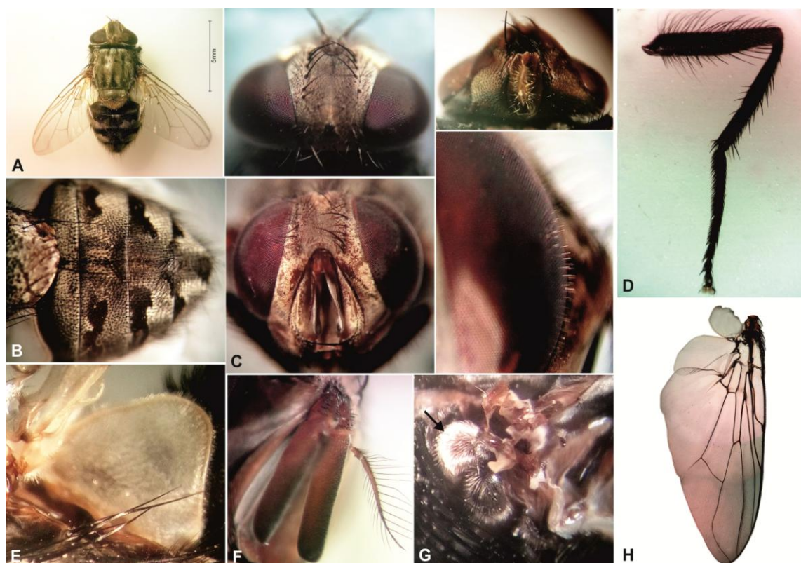
Figure 1: Diagnostic morphological characteristics of adult Passeromyia heterochaeta ; General body shape from above (A), shifting tessellated pattern of abdomen and scutellum (B), head: clockwise including anterior, and dorsal view (parafrontalia), ventral view (parafacialia) with lighter pruinose, varying from brown through golden to silvery white, and haired compound eye, respectively (C), ciliated hind tibiae and bristled femora (D), squamae (E), third antennal segment not reaching the border of the mouth (F), epaulet orange (arrow) (G), and wing venation pattern (H).