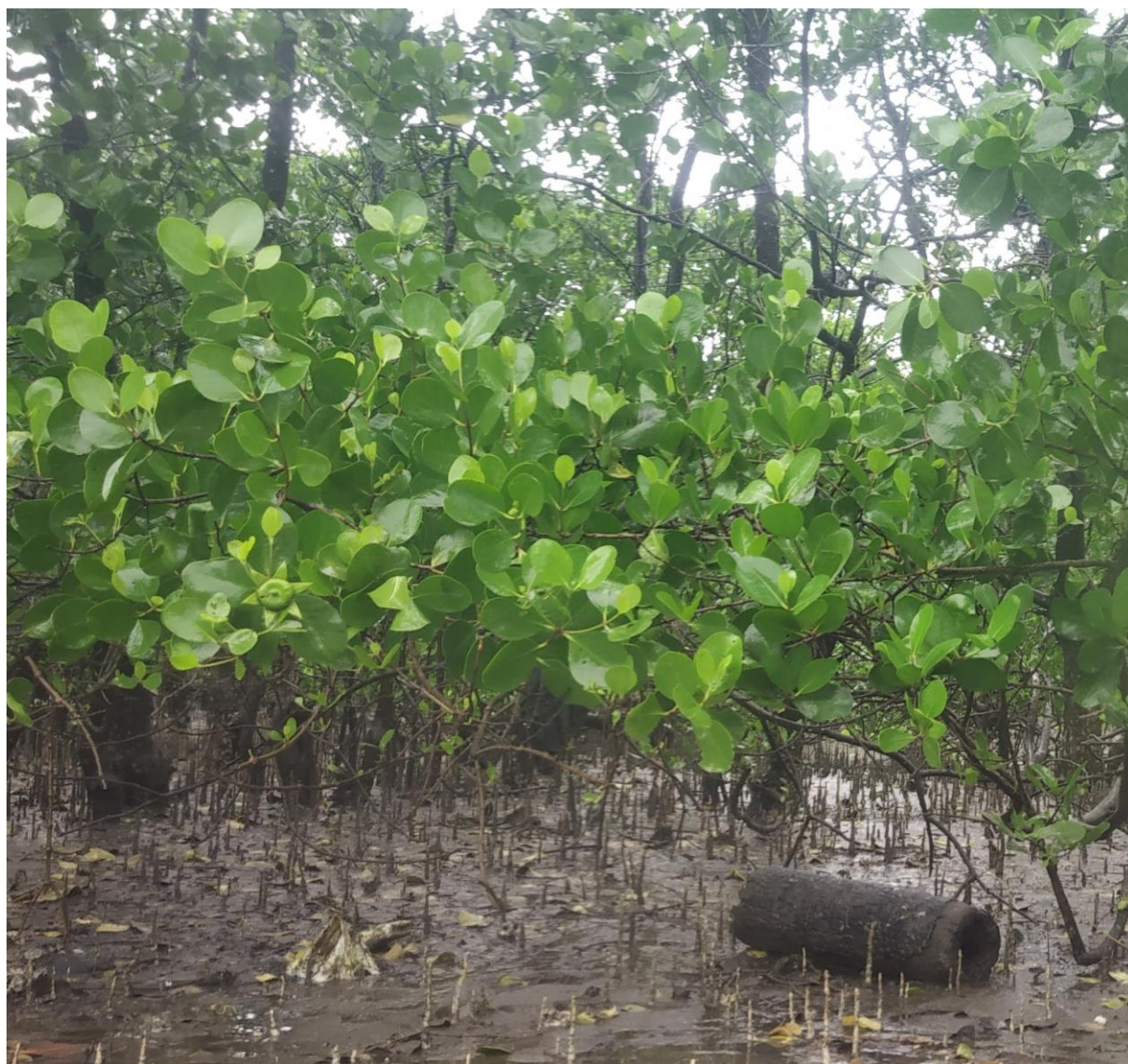
Figure 1: Mangrove habitat inhabited by Metopograpsus cannicci Innocenti, Schubart and Fratini, 2020.

Carapace flat, quadrangular, broader than long, and smooth. Lateral margins entire. Regions weakly defined, urogastric region with groove distinct, branchial region having distinct oblique ridges, cardiac and intestinal regions smooth, with no ridge or tubercles (Fig. 2a). Front broad, deflexed with rugose surface and free margin crenulated, with some concavity, 4 depressed post-frontal lobes along the line of frontal deflexion. Suborbital tooth triangular, suborbital border denticulate (Fig 2d). The exposed surface of the base of the antenna densely pubescent.