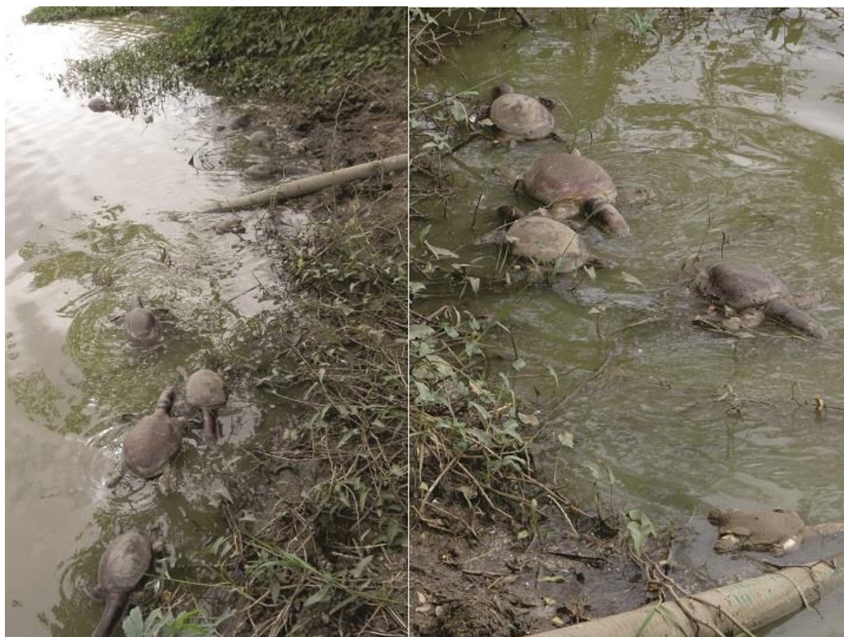
Figure 3: Mass mortality (350 + individuals) of the Indian Flap-shelled turtle Lissemys punctata observed at Vadgam Village, Anand, Gujarat State, India.

The sudden or mysterious death of 1071+ specimens of L. punctata within a five-year span points out that some vigilance and proactive conservation measure is needed to investigate such phenomena. Because earlier a similar case was noted with the mass death of L. punctata in the state, when on 19 th November 2006 about 150 adult specimens of L. punctata were found dead floating in the main Narmada Canal, near Jaspur (23°10'18.75"N; 72°30'16.15"E; a.s.l./elevation 65 m), Ahmedabad (Reuters, 2006). Few of them were sent for post-mortem but until today, the report remains mysterious. However, large numbers of sudden mysterious death of L. punctata in the state is a big question and further subject of serious investigation on these cases, somewhere the authority failed to investigate properly and did not