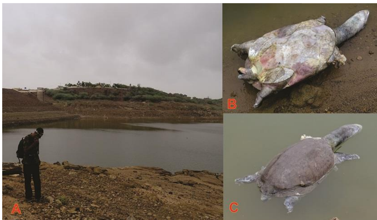
Figure 4: Dead Indian Flap-shelled turtle Lissemys punctata observed at the Rudramata Dam, Bhuj, Gujarat State, (A); habitat of the site, (B); ventral side of a dead individual, (C); dorsal side of a dead individual.