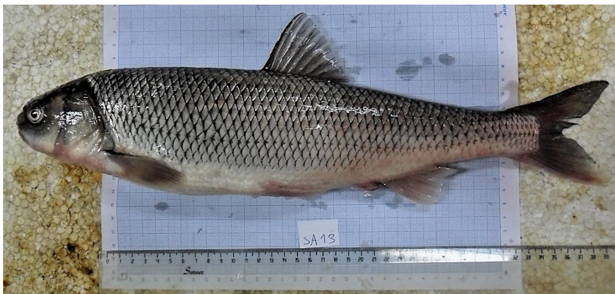
Figure 1: A specimen of Rutilus kutum collected in this study from the southern Caspian Sea.

Size determination in fish is more biologically relevant than age, because several ecological and physiological indicators are more size-dependent compared to age-dependent (Bibak et al., 2012; Imanpour Namin et al., 2013). Therefore, the aim of this study is the investigation of length-weight, length-length relationships and condition factors of R. kutum in the southern Caspian Sea.