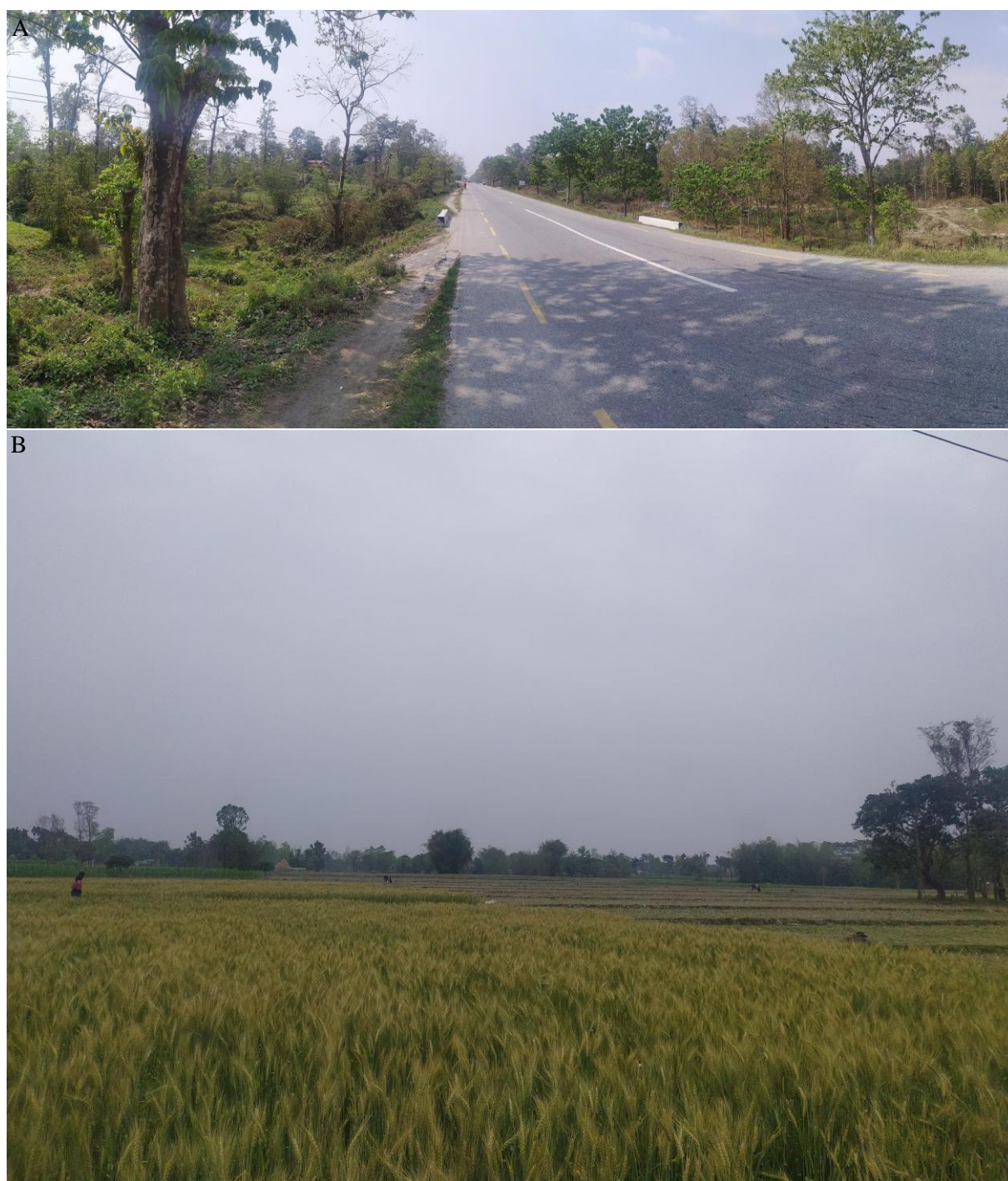
Figure 4: Habitats of two recorded specimens of Oligodon cyclurus in Morang, Nepal (A and B).

comments and suggestions. We also thank Netra Koirala for his field assistance and Sandhya Sharma for map preparation.