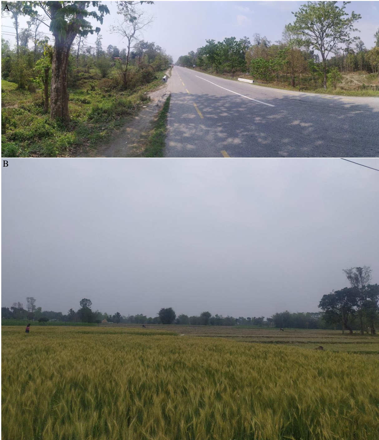
Figure 4: Habitats of two recorded specimens of Oligodon cyclurus in Morang, Nepal (A and B).