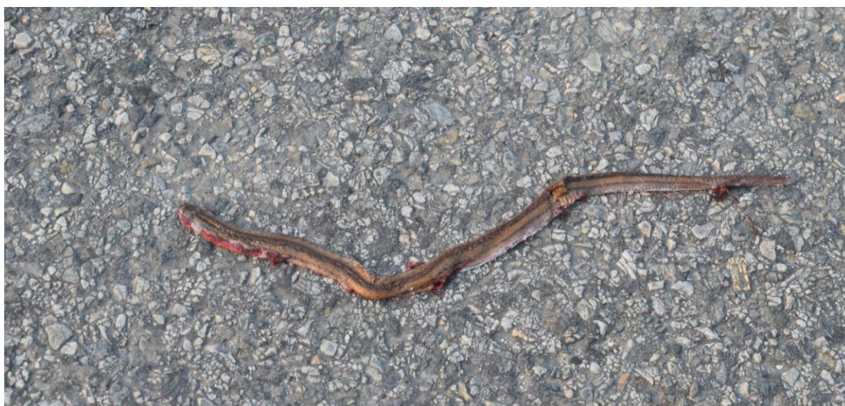
Figure 2: Road-killed specimen of Oligodon cyclurus recorded from Pathari-Kanepokhari road segment, Morang, Nepal.

mm; MSR 19; VS 168; SC 36 (divided); SL 8 (4 th and 5 th in contact with the eye); EyeL 3 mm; IOD 7 mm; IND 6 mm; PrO 2; and PtO 2. The cream-colored vertebral streak ran from the base of the head to the tail tip. The ventral scales exhibited black dots which were more prominent towards the posterior end. However, such dots were absent in the subcaudal scales (Figs. 2 and 3).