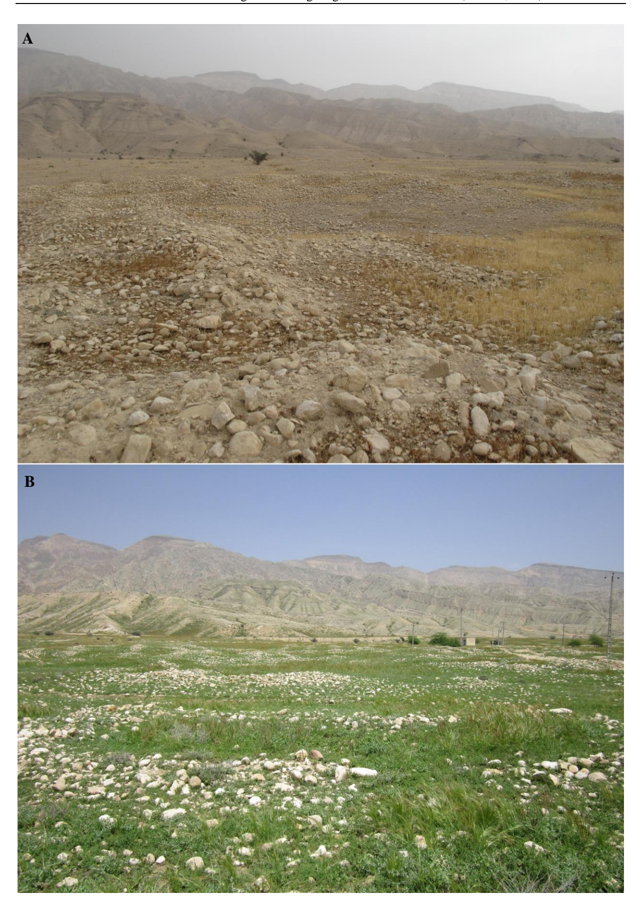
Figure 6: New locality record of Hemiechinus auritus , in hillside of the Varavi Mountain, northeast of Varavi city, southwest of Fars Province in March 2016 (A) and the same habitat in April 2019 (B), respectively.