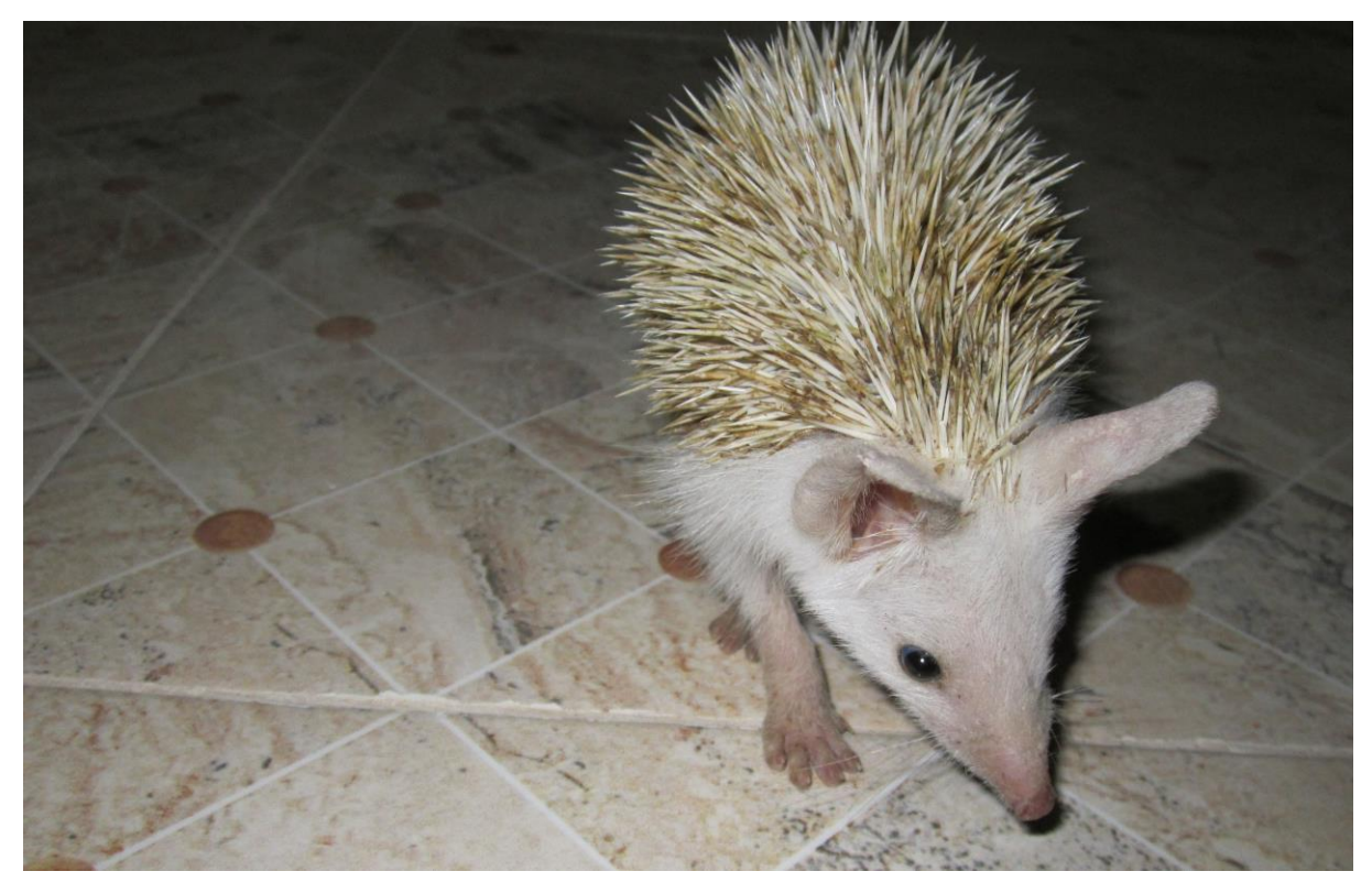
Figure 5: Hemiechinus auritus , in very brief captivity, from Varavi District, southwest of Fars Province.