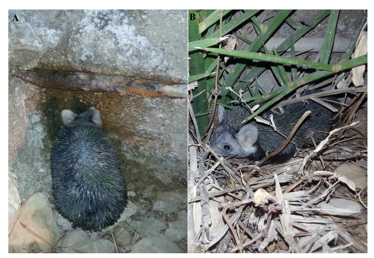
Figure 4: Paraechinus hypomelas from Varavi District, southwest of Fars Province. Entering residential areas for drinking water during summer (A), hiding behavior in the bush (B). Photos by Ali Gholamifard, 13 August 2015.