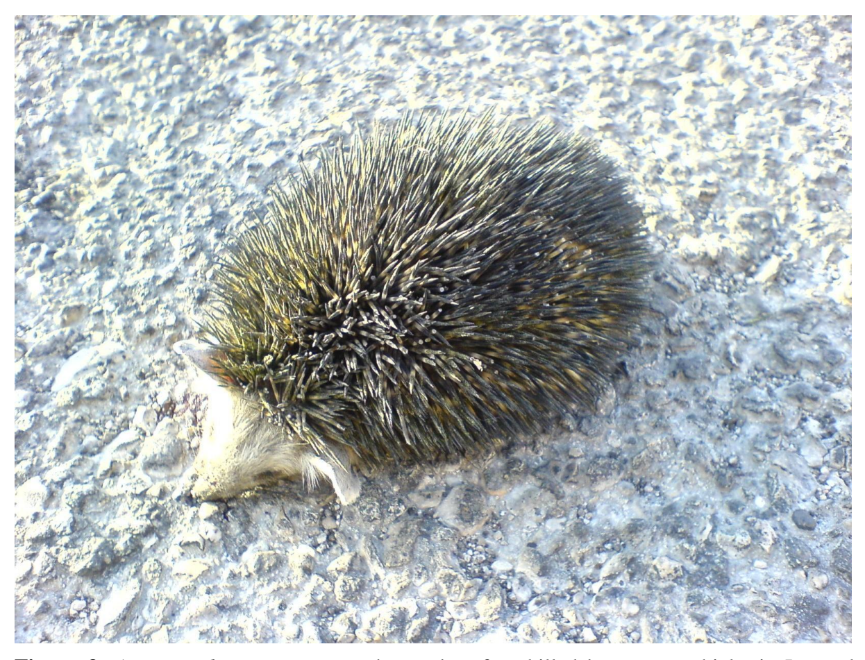
Figure 3: A Hemiechinus auritus on the road surface killed by motor vehicle, in Lamerd region, southwestern Fars Province.

Subsequently, the first author as a zoologist has had a more scientific focus on the mammals of Fars Province, noting where hedgehog specimens were found at the night in desert areas or were killed on the roads by motor vehicles (Fig. 3). Most of the observed specimens were blackish (Fig. 4) but in rare cases they were yellowish. One H. auritus individual (Fig. 3) was found dead on 25 March 2008 in the "Chah Shour Pass" (27°25'56.38"N; 53°18'30.41"E), a mountain pass in the southern Zagros Mountains, about 15 km from the city Lamerd, capital of Lamerd County in southwest of Fars Province (Fig. 2). Its habitat, part of Varavi Mountain, grows on calcareous soils with scattered bushes and trees. The second H. auritus (Fig. 5) was found during the night on 22 July 2018 in Varavi City (27°27'51"N; 53°3'44"E), Mohr County in southwest of Fars Province. The northeast end of the city is near the foothills of Varavi Mountain and close to palm gardens (Fig. 6).