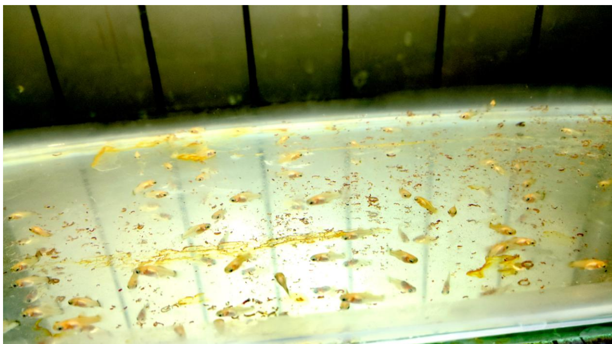
Figure 2: The fry of Xiphophorus maculatus after birth in captivity.