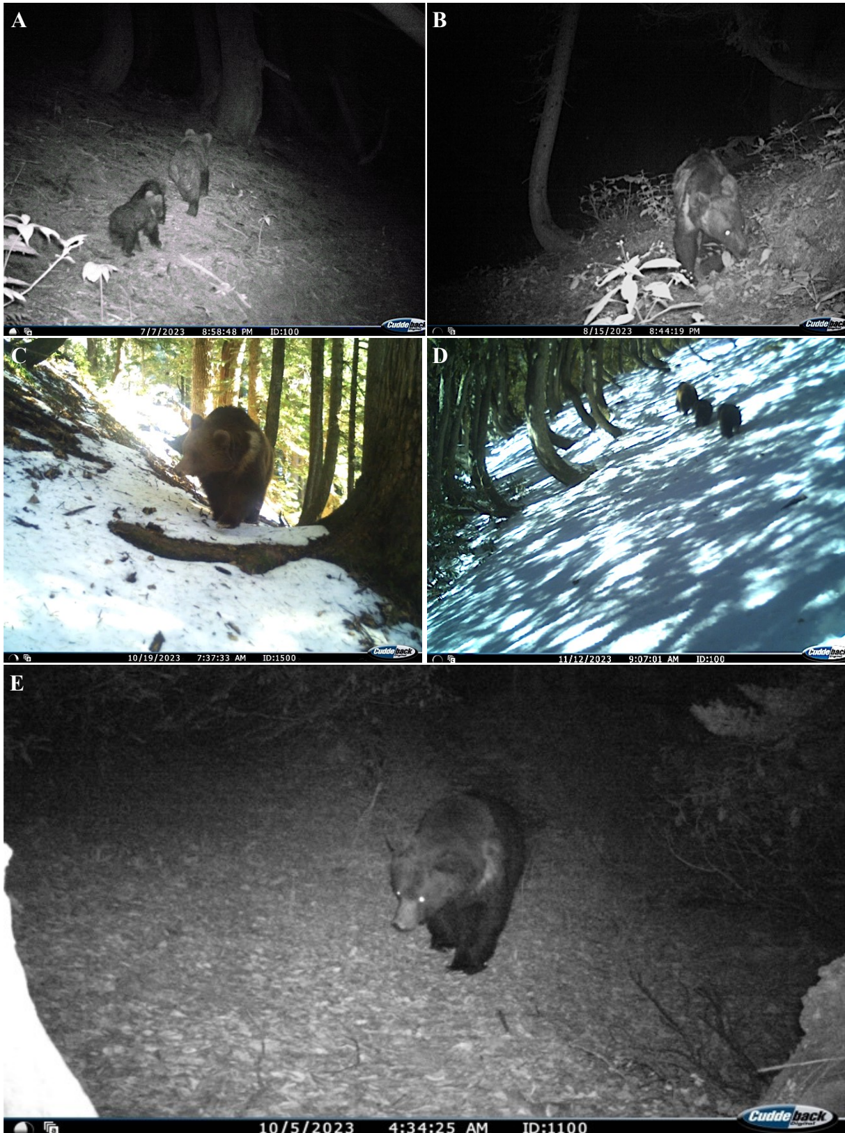
Figure 2: Camera trap images of Himalayan brown bear captured in different grids in Bani Wildlife Sanctuary, (A) an adult female with two cubs near Heiu Nallah (grid-27, 2567 m asl), (B) another adult between Thalli Nallah Forest and Somphu Forest (grid- 27, elevation 2754 m asl), (C) an adult in Dhanbiyal (grid-22, elevation 2765 m asl), (D) an adult female with two cubs in Chattri (grid-7, elevation 3465 m asl), Sudhmahadev Conservation Reserve, and (E), a sub-adult near Seoj Dhar (Sudhmahadev CR, grid-62, elevation 3230 m asl) Jammu and Kashmir, India. All images are the photo captures triggered by IR cameras.