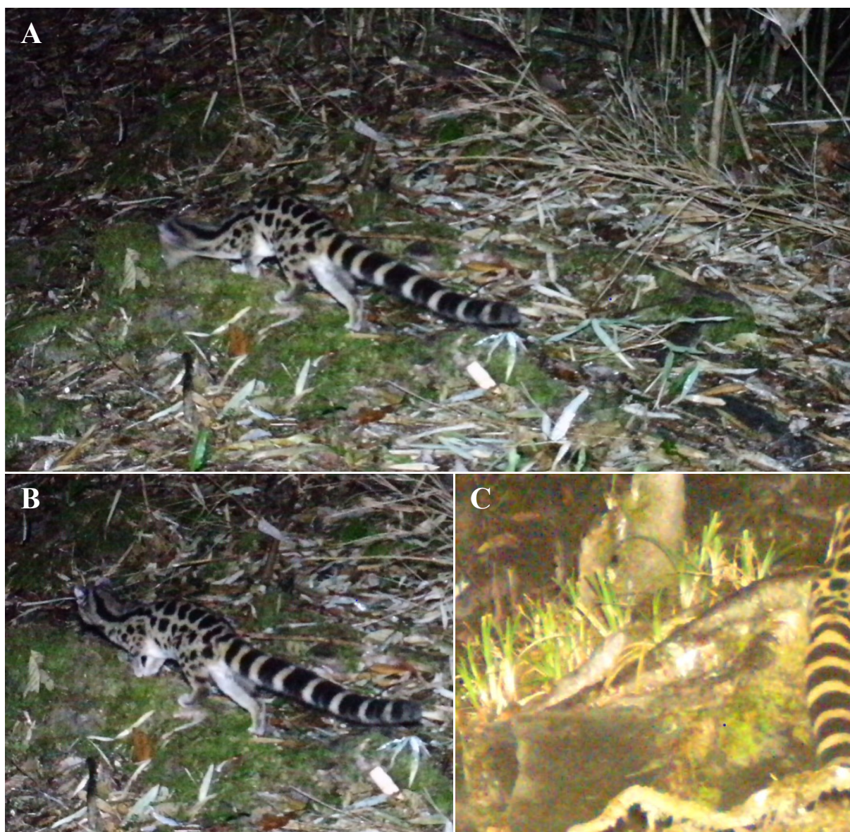
Figure 2: Camera-trap images of the Spotted linsang Prionodon pardicolor from the Tashigang Forest Division, recorded in 2014–2015 (a, b), and 2020 (c).

In Bhutan, P. pardicolor is so far known from only few locations, most commonly in the western region. During a tiger inventory in the Jigme Dorji National Park (2011–2012) in northwestern Bhutan by Thinley et al. (2015), a single image of P. pardicolor was recorded at elevations between 2,063 and 4,105 m a.s.l. in mixed-conifer forests. Later, during the NTS (2014–2015), the species was recorded at two different locations in the Gedu Forest Division in southwestern Bhutan, at elevations between 2,150 and 2,718 m a.s.l. in cool broadleaf forest with sparse stands of Rhododendron arboretum (Dhendup and Dorji, 2018). These findings indicate that cool broadleaf forest and mixed conifer montane forest of Bhutan support significant habitat niches for such rare species and important wildlife corridor to the larger landscape of the eastern Himalayas.