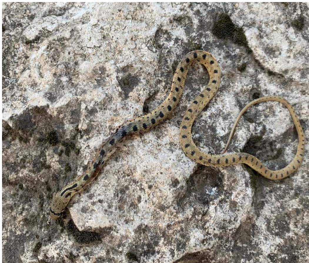
Figure 2: General view of Platyceps ventromaculatus from Kızıltepe, Mardin, Turkey.